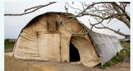
After a long way to reach Greece, migrants spend the night in an old tent the border.