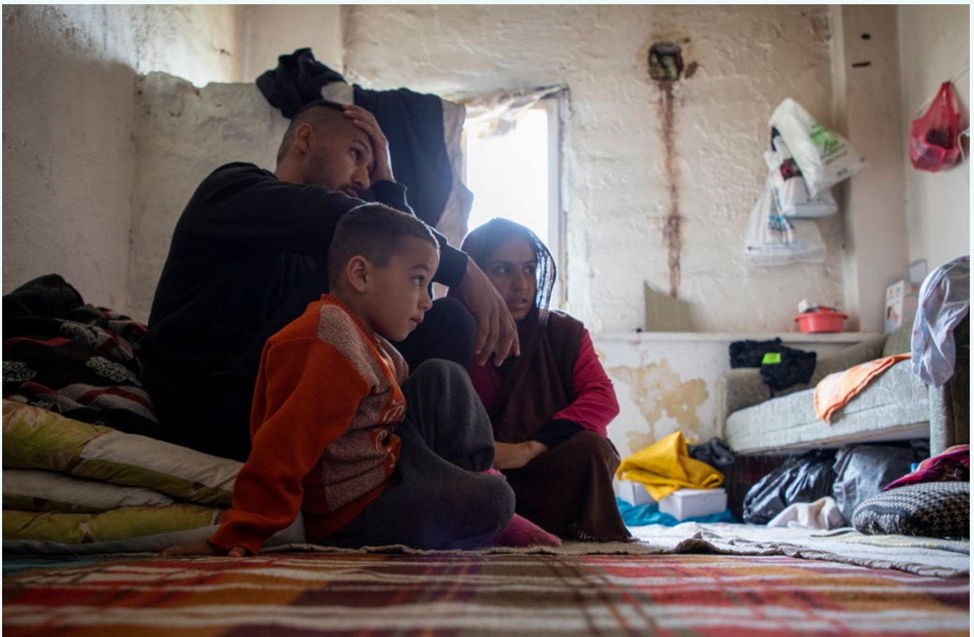
After their failed attempt to cross over to Greece, an Afghan family with their new born baby temporarily stay in an old school classromm in Meriç until winter is over.