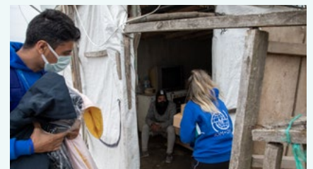
IOM Mobile Teams provide blankets and winter clothes items to migrants stranded between Turkey and Greece.