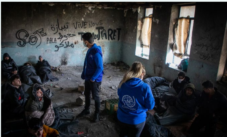
IOM Mobile Teams found dozens of vulnerable migrants without access to basic needs in an old building. Teams are reaching out migrants to provide humanitarian assistance.