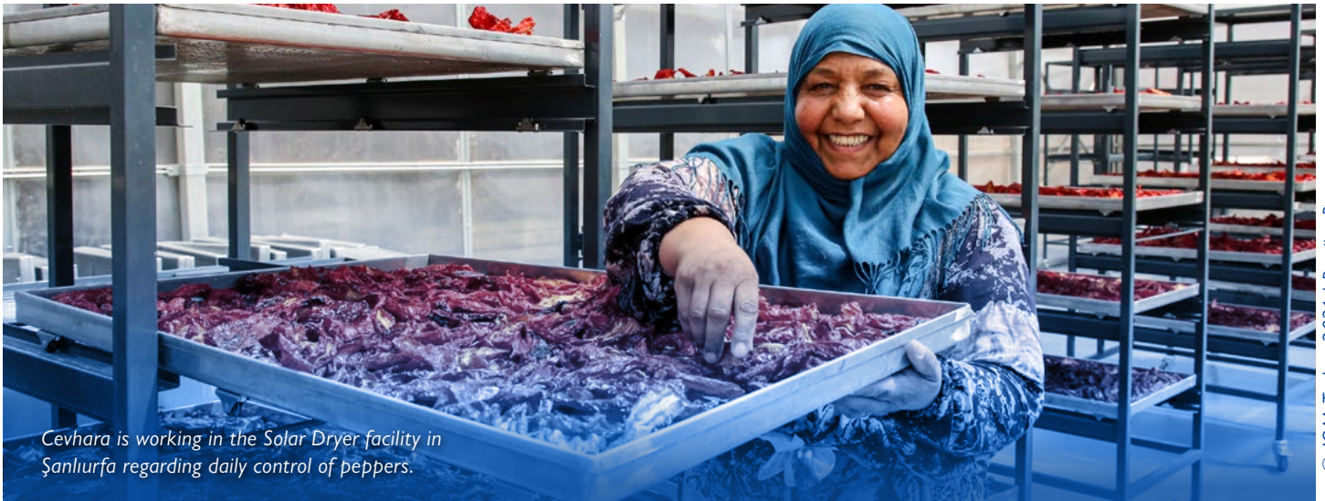
Cevhara is working in the Solar Dryer facility in Şanlıurfa regarding daily control of peppers.