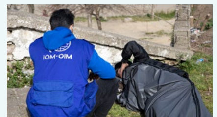
Having survived a cold night, a migrant, full of hope, meets IOM Mobile Teams in the morning.