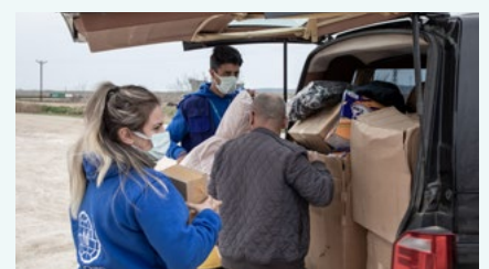
IOM Mobile Teams provide humanitarian assistance to migrants who are stranded on the Turkish side of the Meriç river.