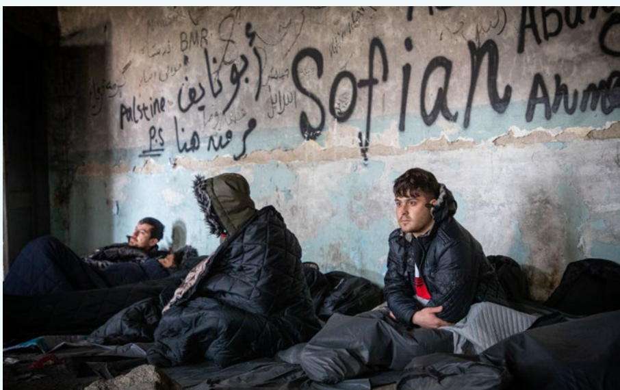
A group of migrants sleeping side by side in an old building near border.

2 Other nationalities by the order of beneficiary number include Federal Democratic Republic of Nepal, Republic of Iraq, Federal Republic of Somalia, Arab Republic of Egypt, State of Palestine, Democratic Republic of Algeria, Republic of Tunisia, Islamic Republic of Iran, State of Eritrea, Republic of India, Union of the Comoros, Republic of Senegal, Republic of Mali, Republic of the Congo, Republic of South Africa, Republic of Mauritania, Kashmir, Burkina Faso, Republic of Yemen, Republic of Biafra, Republic of Nigeria, Republic of the Gambia, Dominican Republic, Kingdom of Denmark, Republic of the Sudan, Hashemite Kingdom of Jordan, Republic of Azerbaijan, Republic of Turkey, Lebanese Republic, Republic of Kenya.