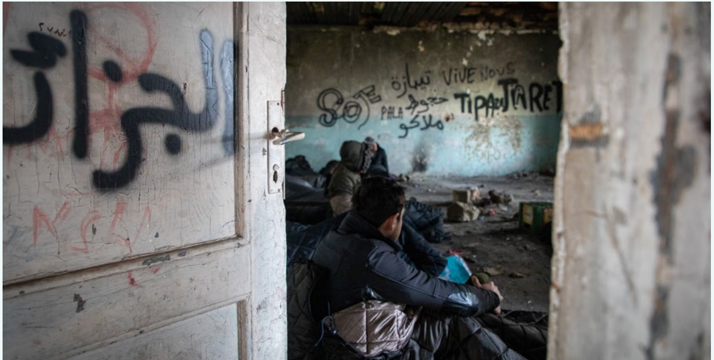
Migrants, hoping for a safe and dignified life, greet the IOM Mobile Team at an old school building where they stay.