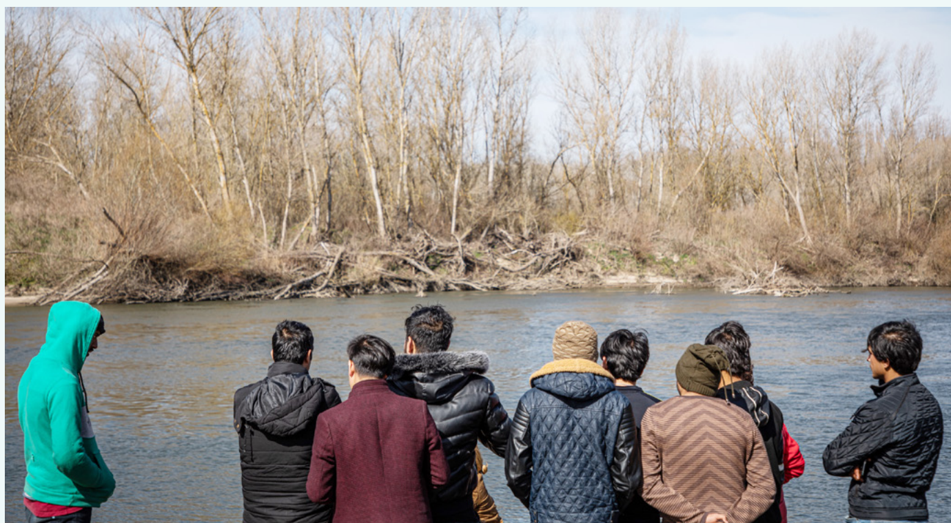
A group of migrants from different nationalities, on the Turkish side of Meriç (Maritsa) river, observing the Greek side to cross and reach to EU.