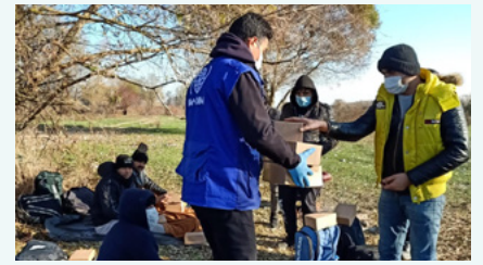
IOM Mobile Teams, providing humanitarian relief items to Migrants stranded between Turkey and Greece.