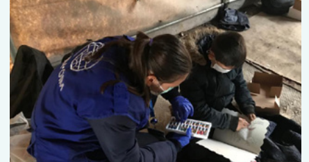
IOM Mobile Team doing recreational activities with a Syrian family to reduce the stress level of children in dire conditions.