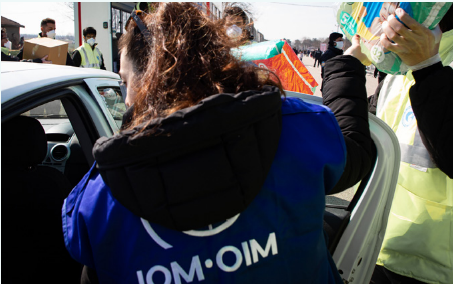
IOM staff deploying aid packages for the migrants stranded in between Turkey and Greece border.