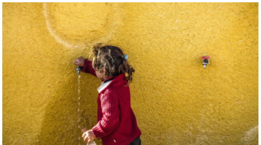
Winterization activities provide much-needed support for families dealing with harsh weather conditions

As part of its winterization activities, IOM distributed 67,000 winter clothing kits and 10,700 NFI kits including mattresses, blankets, jerry cans, solar lamps, kitchen sets, hygiene kits, plastic sheets, baby diapers and carpets through 11 local implementing partners across 17 locations. IOM also responded to the shelter needs of displaced families by providing 1,775 new tents, 18,412 plastic sheets and 431,715 square meters of insulation material. Activities covered 32 IDP camps/informal settlements and benefited a total of 9,206 households. Additionally, through its emergency common pipeline, IOM procured, stored and transferred 28,823 NFI kits to humanitarian partners. According to the SNFI Cluster, this was the first time in the seven-year crisis that winter items were delivered before the end of the year.