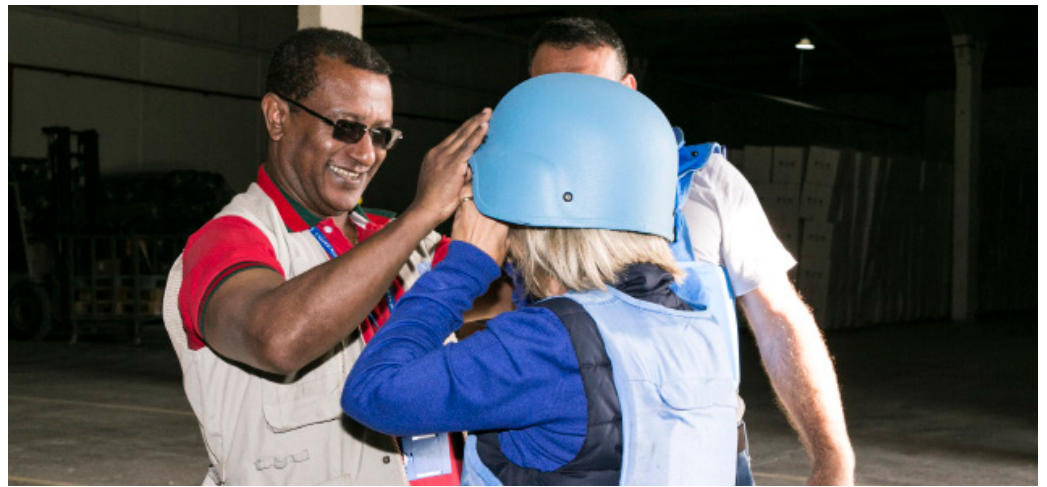
SSAFE training prepares trainees for a range of challenging circumstances

Since April 2017, IOM in collaboration with UNDSS, has been carrying out Safe and Secure Approaches in Field Environments (SSAFE) Training in Gaziantep. The OCHA-funded programme provides essential security and safety awareness training to all UN and associated personnel operating in areas of high risk. A total of 237 humanitarian staff took part in the training in 2017. Parallel to SSAFE, the IOM Security Coordination and Training Officer has been providing essential First Aid (IFAK) training programmes mission-wide. From October to December 2017, 46 UN staff members were trained in Istanbul, Ankara and Gaziantep.