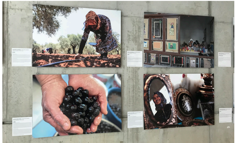
Photos from IOM Turkey exhibited at the Talk for Equality event at Cer Modern, Ankara