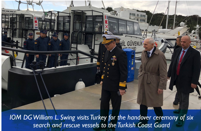
IOM DG William L. Swing visits Turkey for the handover ceremony of six search and rescue vessels to the Turkish Coast Guard