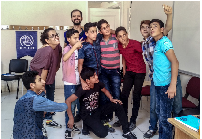
Young Syrian and Turkish beneficiaries getting to know each other