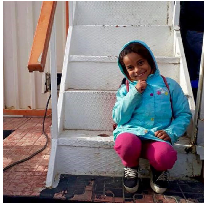
A rescued migrant girl received assistance from IOM

Alongside humanitarian support, IOM Turkey and IOM Director General William Lacy Swing handed over six state-of-the-art search and rescue vessels to enhance capacity of the Turkish Coast Guard on 24 February. Recent video footage of the rescue of 42 Syrians from a sinking boat in the Aegean Sea underlines the imminent need for increased support to safeguard the lives of the thousands that have attempted the fraught crossing in recent years. The vessels, specifically designed for search and rescue operations, can operate under harsh weather conditions and have the capability to right themselves when capsized and so far 578 migrants and refugees at sea have been rescued in them. To accompany the boats, IOM trained 629 TCG staff on topics such as international migration law, counter-migrant smuggling and human trafficking.