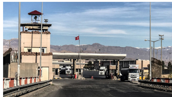
Habur Border crossing point between Turkey and Iraq

In October 2017, as part of the EU-TR-funded project “Regional Co-operation on Border Management with Greece and Bulgaria Phase 2 (RCBM)”, a project launch and first project steering committee meeting was held in Ankara to coordinate with all involved parties. The project aims to support Turkey’s border management efforts by enhancing cross-border cooperation with Greece and Bulgaria. IOM’s border management team also began field work at the eastern and southern borders of Turkey alongside the Ministry of Interior. The UK-funded project “Integrated Border Management Assessment (IBM) in Turkey” will provide valuable information to build the most appropriate response to managing Turkey’s most challenging borders.