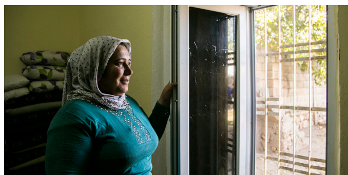
New windows provide insulation and privacy in beneficiary homes

In addition to health, water, nutrition, and sanitation, shelter is an essential component of survival in a post-disaster environment. Shelter not only provides physical protection from the elements, but also privacy, dignity and psychosocial well-being. The IOM Shelter Unit helps vulnerable migrants, refugees and host community members. With an interest in providing a better living area and protection from the cold weather during winter, the IOM SSU Team is creating a total of 1,250 shelters (250 of which were already rehabilitated with a further 1,000 undergoing rehabilitation post assessment in December), improving the living conditions of 8,600 beneficiaries. As part of this project IOM offers the opportunity for beneficiaries to earn cash for work and gain skills by participating in the rehabilitation process.