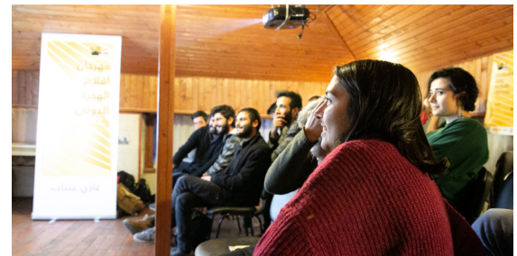
Film screening in Kirkayak Arts and Culture Centre, Gaziantep

The Global Migration Film Festival organized globally by IOM, features films and documentaries that capture the promise and challenge of migration and the unique contributions that migrants make to their host communities. IOM Turkey brought films and debate to over 500 people across seven cities in the country. In Ankara, a special photo exhibit, 'Migration with Dignity' and an engaging panel discussion was held at the French Institute. Events were also conducted across the southeastern provinces of Sanliurfa, Hatay and Adana in partnership with cultural, municipal and community centres.