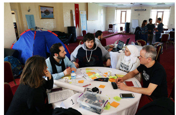
A group of young Syrian students attending a consultancy session to support their entrepreneurship project at Gaziantep University

Funded by the European Union, "Opportunities for Lives" includes activities to increase economic and social resilience of both groups by strengthening opportunities for labour market integration. IOM will play a main role in delivering vocational, entrepreneurship and awareness trainings and provide business start-up grants and competitions. The nine target provinces are Ankara, Istanbul, Bursa, Konya, Gaziantep, Şanlıurfa, Adana, Mersin and Hatay. With a particular focus on youth and women, the project will partner with public agencies at the central and provincial level, municipalities, workers' and employers' organizations.