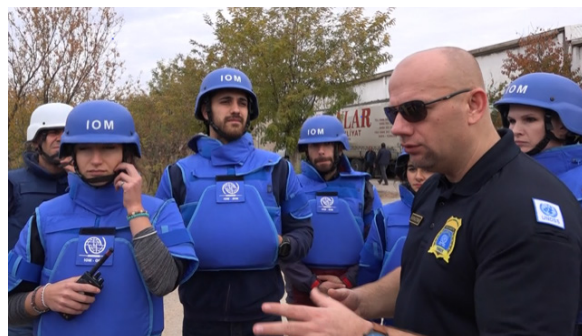
SSAFE training helps humanitarian workers increase their personal security awareness and understand measures that can be taken to mitigate risks in hostile environment

Training covers eight modules, including United Nations Security Management System (UNSMS); History, Background and Culture of the Host Country; Radio Communications; Personal Security; Weapons Awareness; Travel, Convoy and Vehicle Security; Hostage Survival and Incident Management and Basic Life Support. A total of 548 humanitarian staff took part in the training from different United Nations Agencies, Funds, and Programmes by the end of 2018.